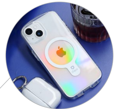
iFace Inner Sheet Aurora

Perfect for showcasing photos, stickers, and other decorations. Create a unique look with each different color.