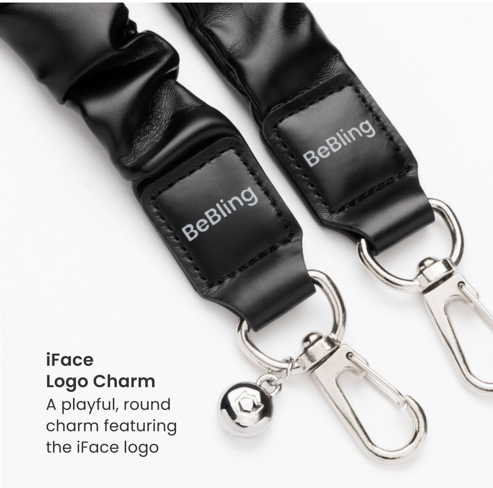
iFace Logo Charm A playful, round charm featuring the iFace logo

Elegant shirring details that flow like waves add a touch of style