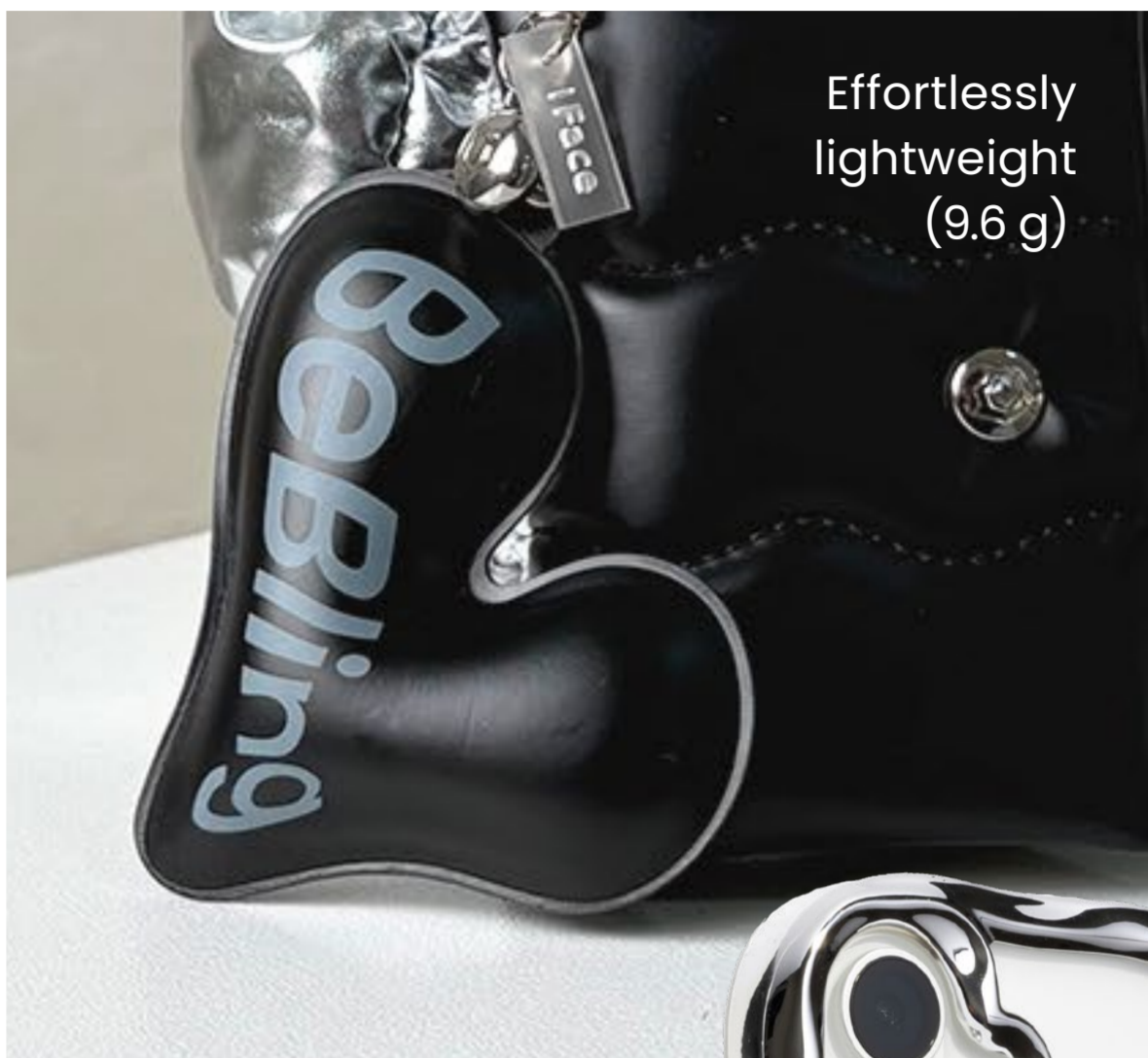
Be Sparkle, Be Bling