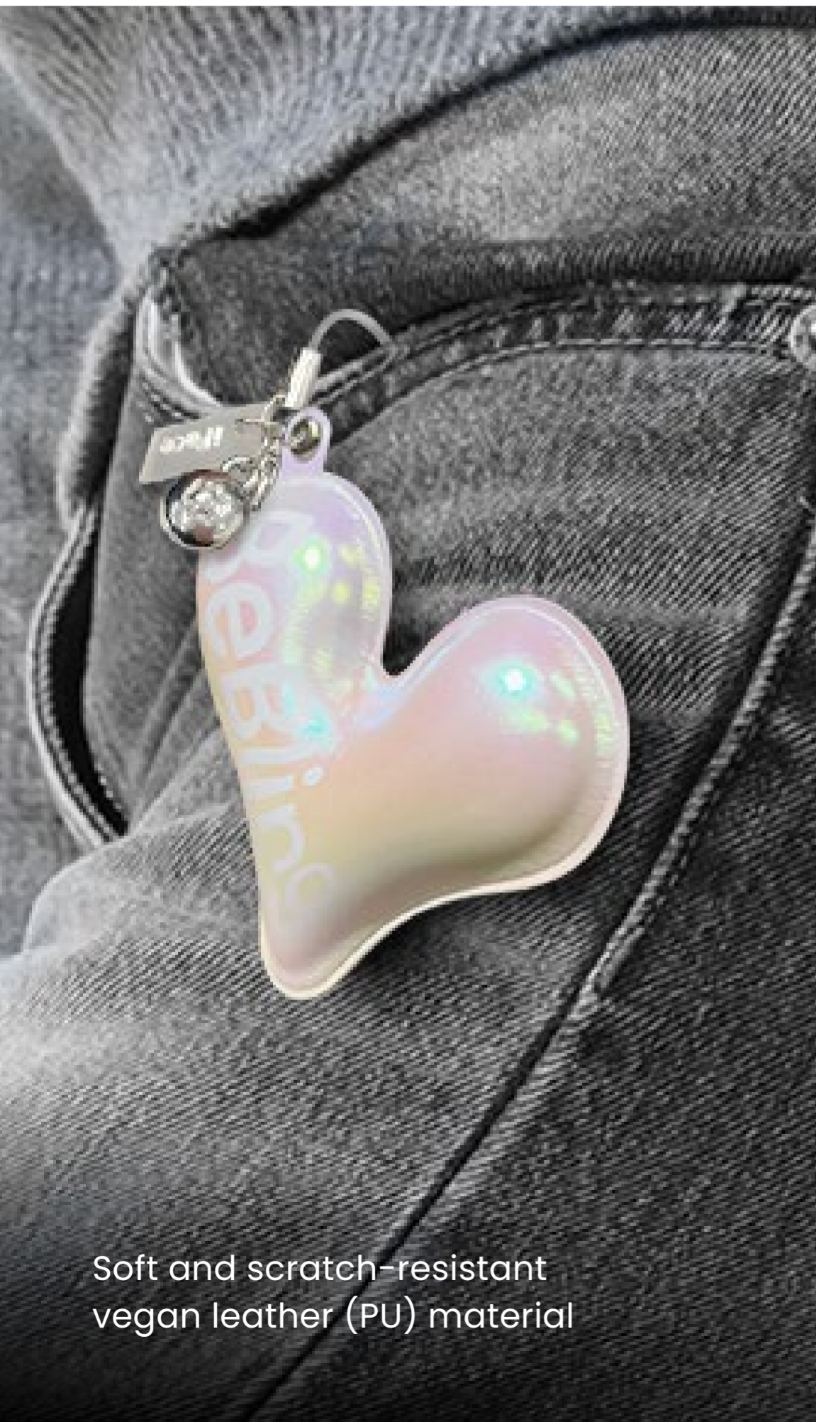
Soft and scratch-resistant vegan leather (PU) material