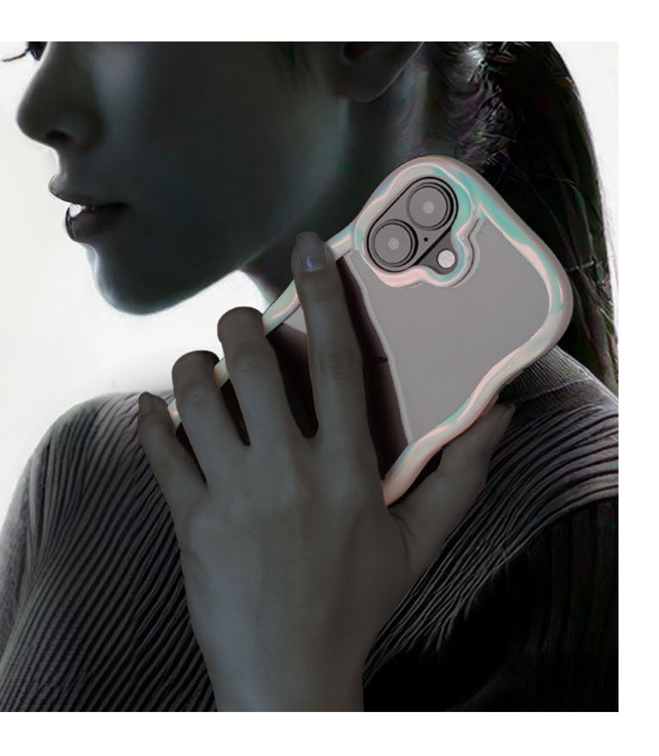
The beauty of graceful curves, inspired by lights in motion