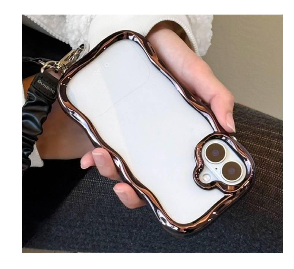
Comfortable grip with wave shape